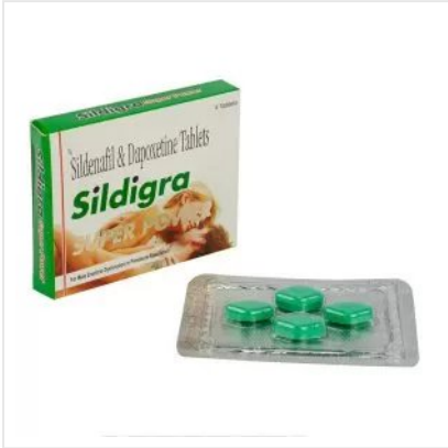
Sildigra Super Power