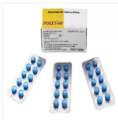
Poxet 60 mg