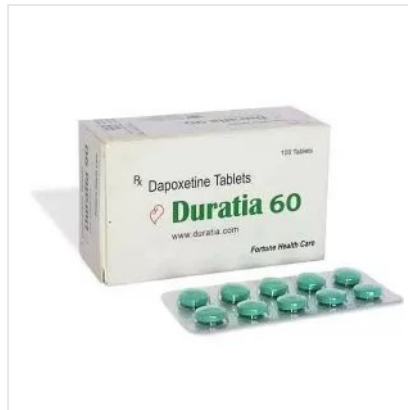
Duratia 60 mg