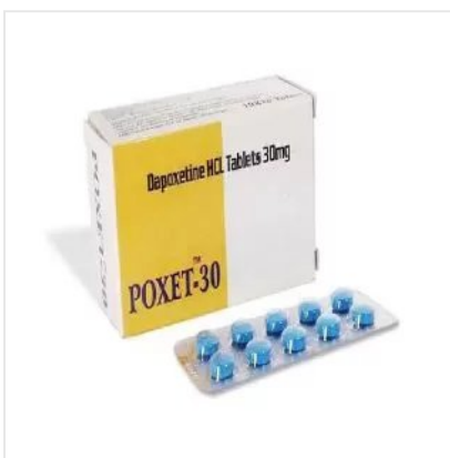
Poxet 30 mg