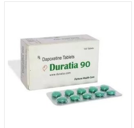
Duratia 90 mg