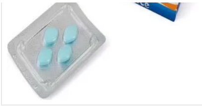
Extra Super P Force