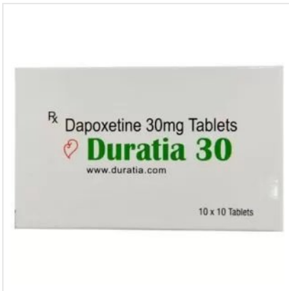
Duratia 30 mg